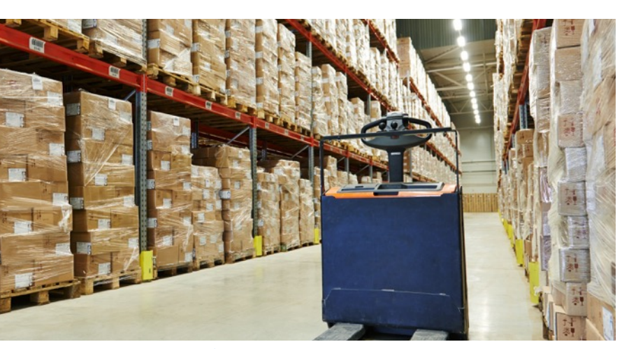
One of the largest areas of risk to suppliers and wholesalers is Business Interruption: some of the largest claims are in relation to the effects of loss of profits and sales. Our property experts know the risk and are experienced to advise and implement key additions to your insurance policy.

Being a niche broker for Commercial Combined and stock throughput risks, L&G are well placed to ensure your business and your clients goods are covered and in good hands.