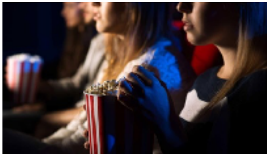
Cineworld / Vue

Up to 50% off monthly membership fees. A joining fee will apply.